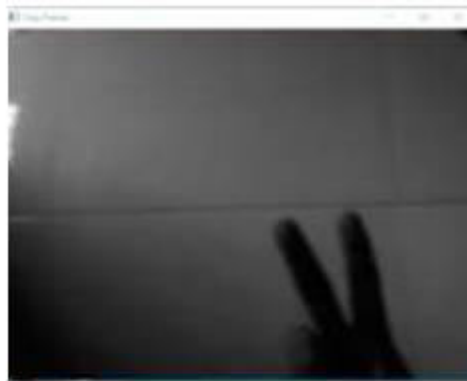
Fig.2. Grayscale Frame

A. Gray Frame : The image is a little blurry in gray scale because there is only one intensity value in Grayscale, where as there are three intensity values in RGB (Red, Green, and Blue) images. As a result, calculating the grayscale intensity difference should be simple.